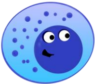
Natural killer cell