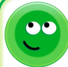
Blood stem cell (Hematopoietic stem cell)